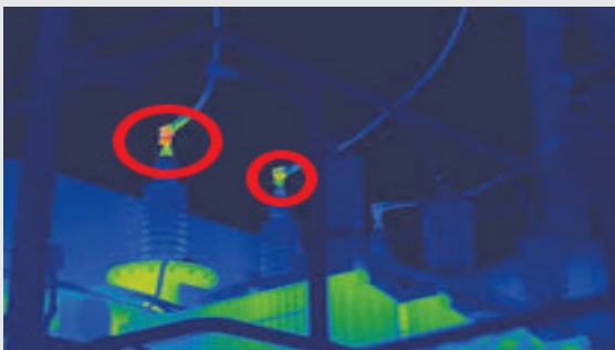
Thermal image showing hot connections on a substation transformer.

Learn more about the Nebraska grown technology - Fast Forward – at www.ff-ai.com/intro