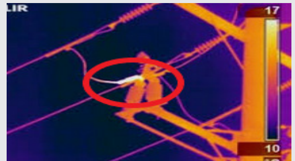
Thermal image showing bad connection on a switch.