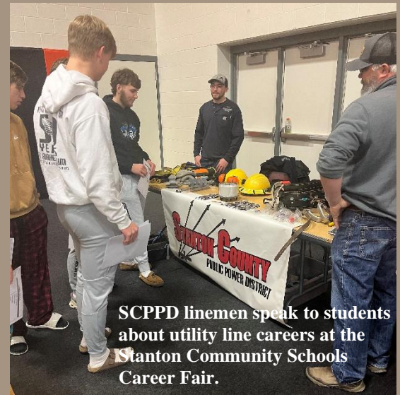
SCPPD linemen speak to students about utility line careers at the Stanton Community Schools Career Fair.

When a problem is reported, lineworkers must identify the cause and fix it. This usually involves diagnostic testing using specialized equipment and repair work. To work on poles, they usually use bucket trucks to raise themselves to the top of the structure, although all lineworkers must be adept at climbing poles and towers when necessary. Workers use specialized safety equipment to keep them from falling.